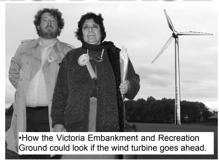
How the Victoria Embankment and Recreation Ground could look if the wind turbine goes ahead.

"There are plenty of industrial parks nearby that would be perfect this project."